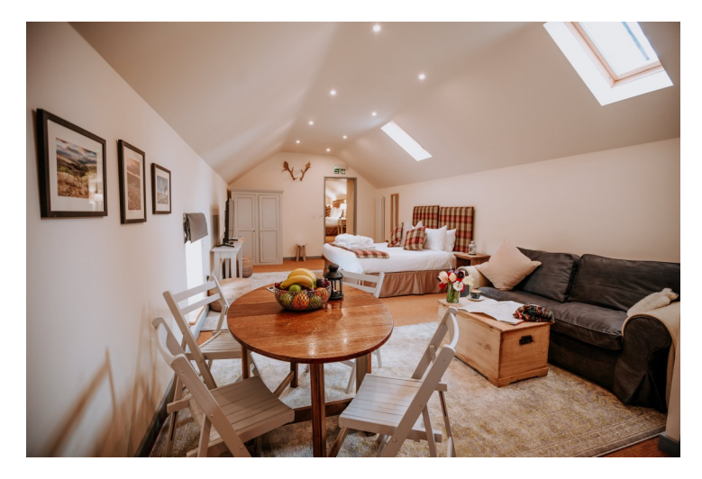
Above and below: double bed (which can twin) in The Loft with the sofa bed.

The Loft is above the Residents' Lounge in the Long Barn. Two spacious rooms sleeping up to 6 people on 2 double beds (which can be twinned), and a double sofa bed. There are external stone steps leading up to the Loft with an external door. The room has 2 interconnecting rooms which separate the double beds, with 2 steps and a door which separate these rooms. There is a shower room with shower, toilet and sink.