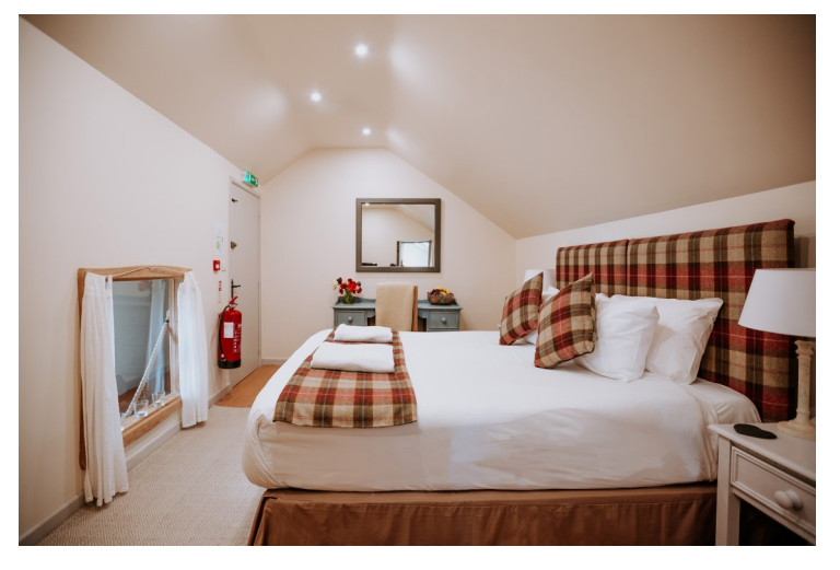
The second room within The Loft.