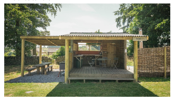
Kitchen and hot tub area