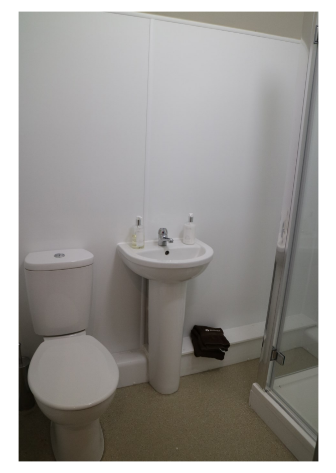
Toilet, sink and Shower.