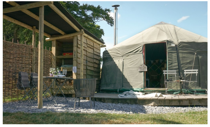
Entrance to Yurt

The BBQ, communal kitchen and hot tub area is on a raised wooden platform with picnic benches. There are three steps on to the communal kitchen platform which are 30cm and 23cm in height. The BBQ area's surface is small blue slate pebbles with level access. Access into the hot tub is via 3 steps which are 33cm, 24cm and 46cm in height.