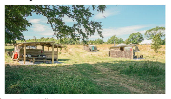
Access to Yurts