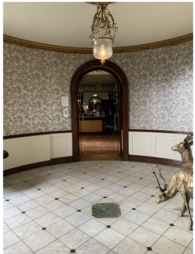
Entrance leading to the reception desk