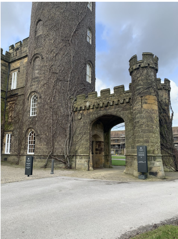
Main entrance under the archway