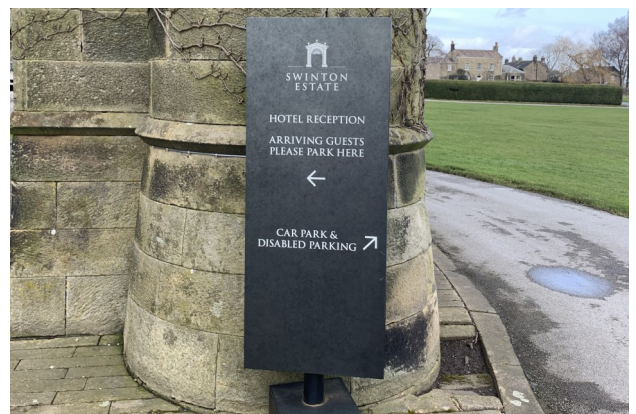
Clear signage around the Estate