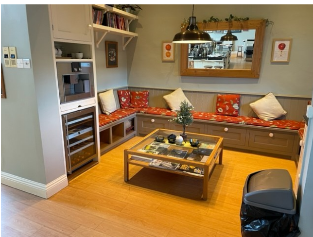
Relaxed seating area