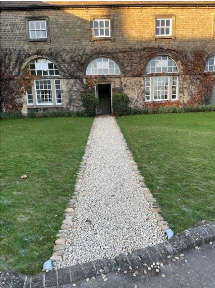
Gravel footpath leading to Swinton Cookery School