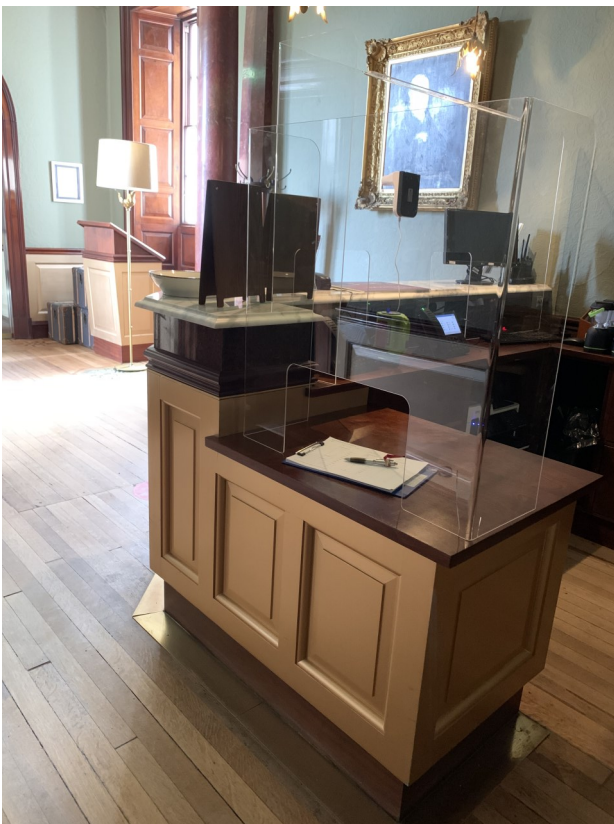
Lowered reception desk