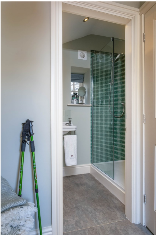
Ground floor Shower Room