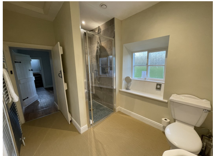
Downstairs shower room with walk-in shower