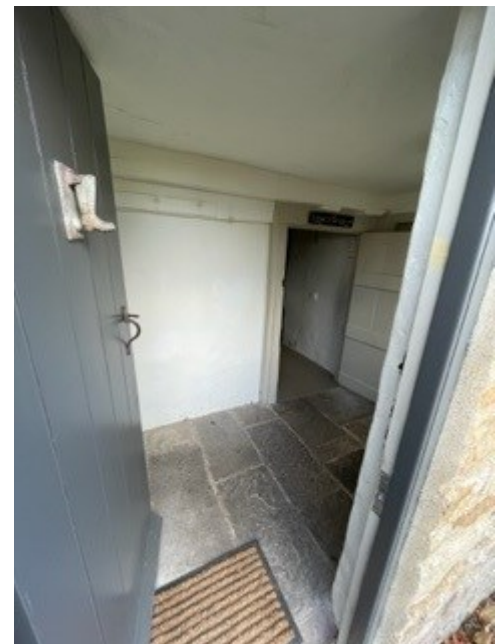
Entrance way from the car park