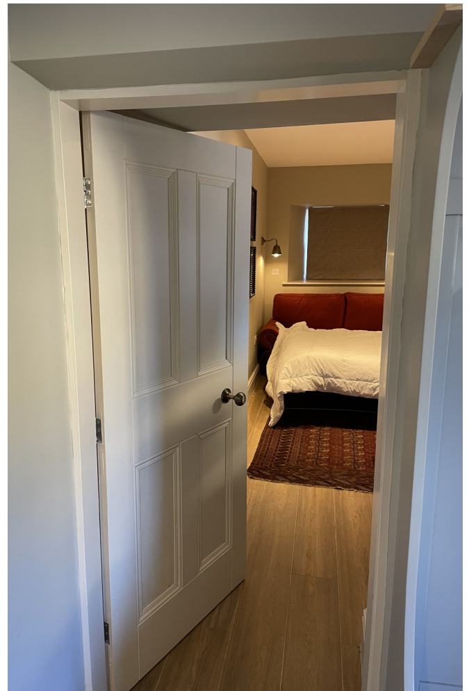
The ground floor 'Snug' room with sofa bed