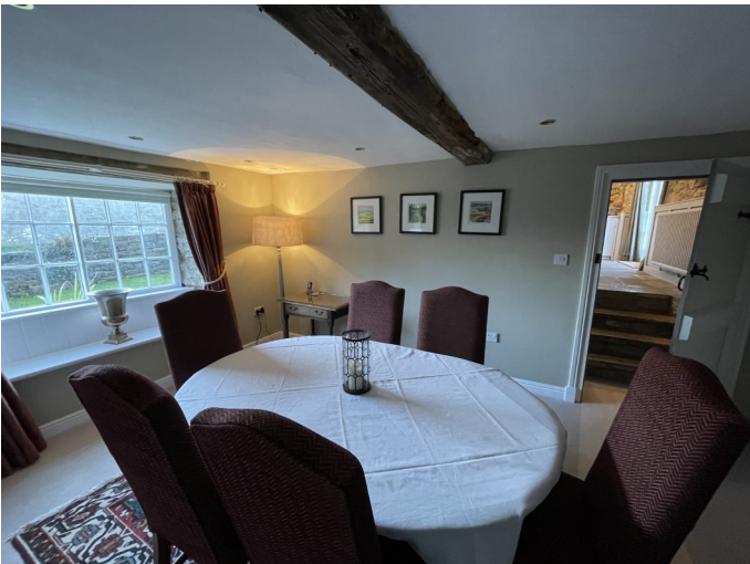
The dining room showing the steps into the kitchen