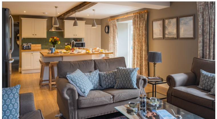
Top image: Sitting Room / Kitchen