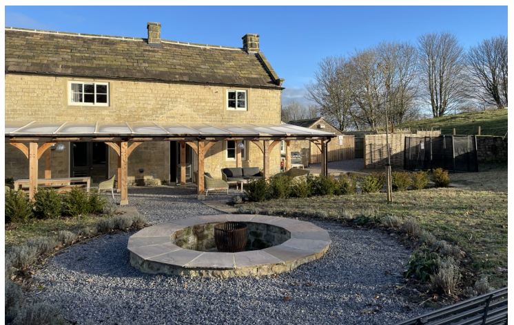
Above: Swinton Grange outdoor seating, fire pit and trampoline garden area.