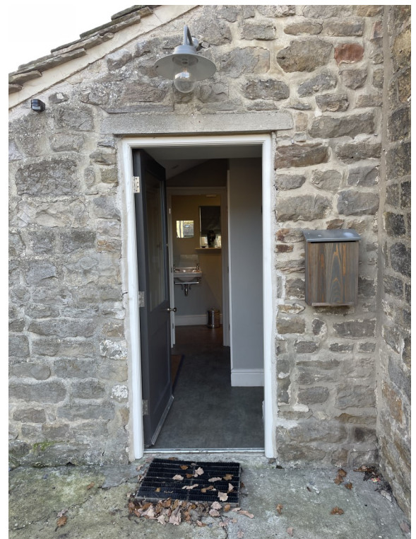
Boot Room door