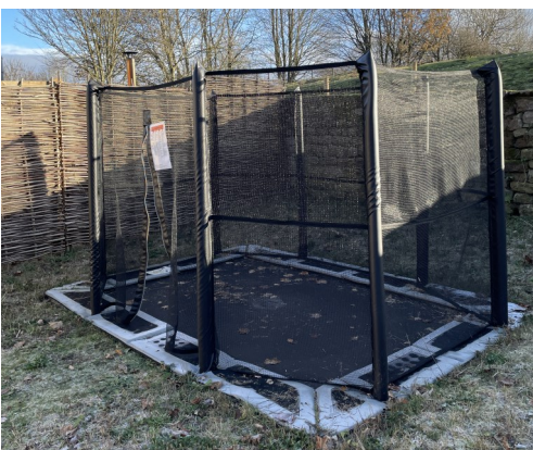
Left: The private hot tub and trampoline.