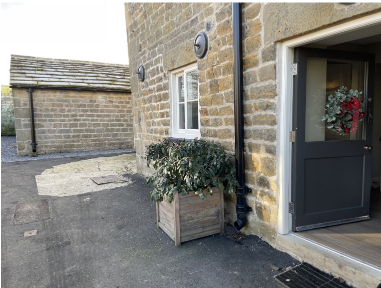
Front door into the cottage