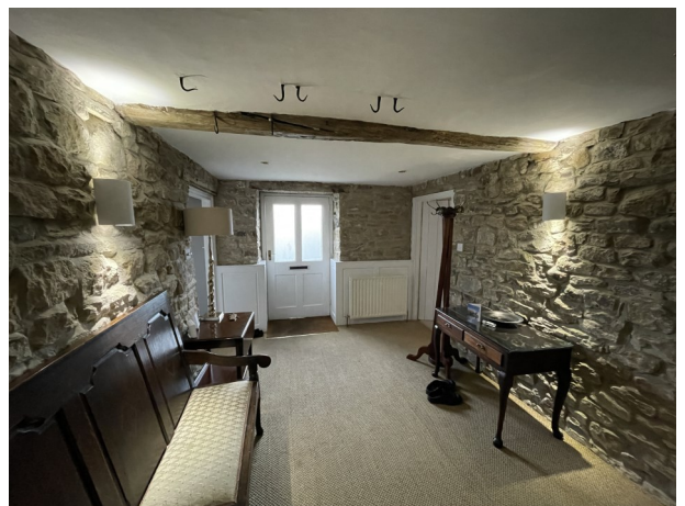
Entrance to High Swinton Cottage