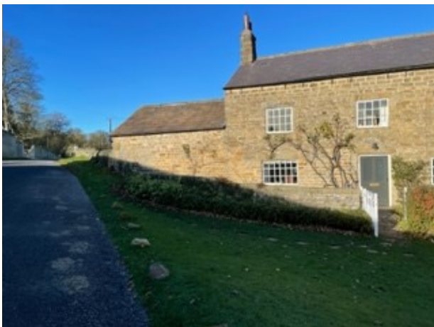
External access to High Swinton Cottage