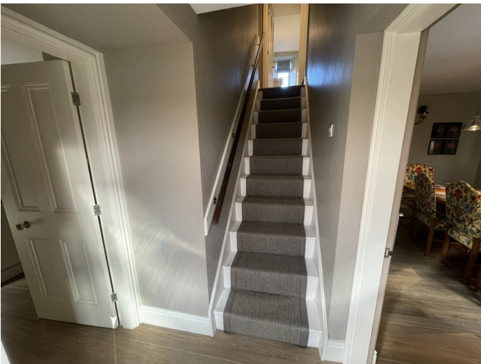
Stairway between the Kitchen and Dining Room leading to the first floor