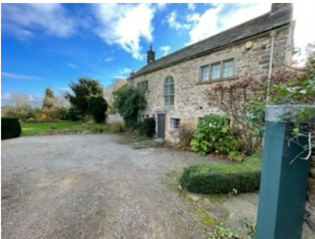
Car park with gravel driveway