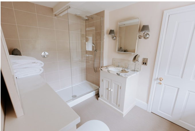
Above and below: 'Jack and Jill' bathroom