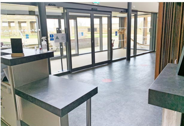
Reception at Swinton Country Club and Spa