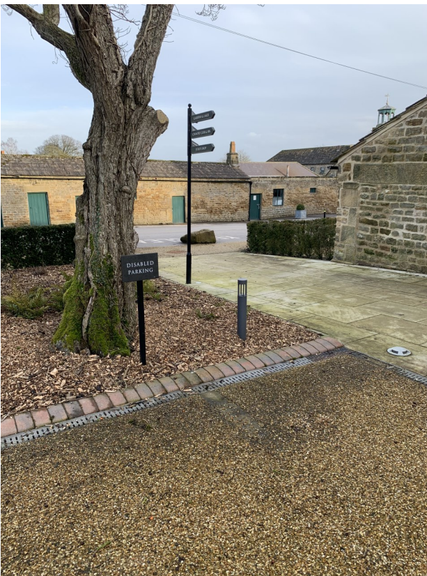
Blue badge parking at the Country Club and Spa