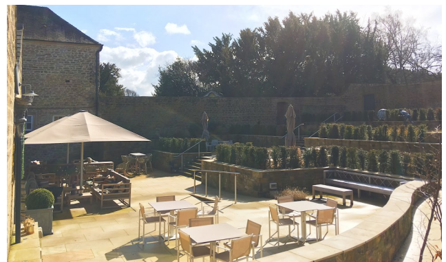
Outside at The Terrace