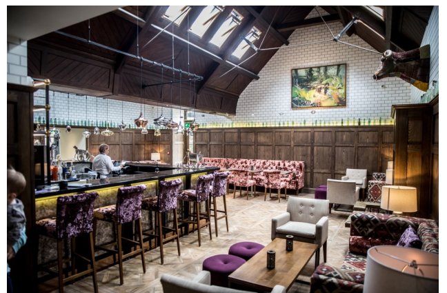
Inside The Terrace Bar