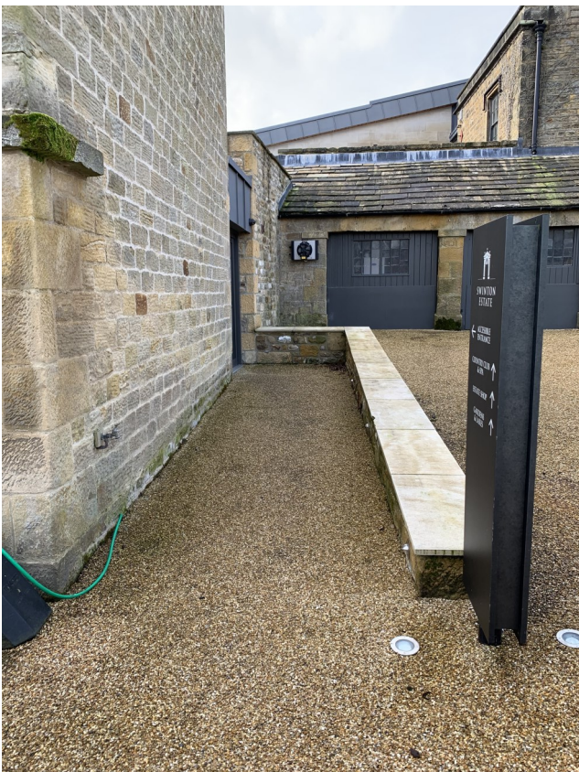
Slight ramp leading to The Terrace accessible entrance