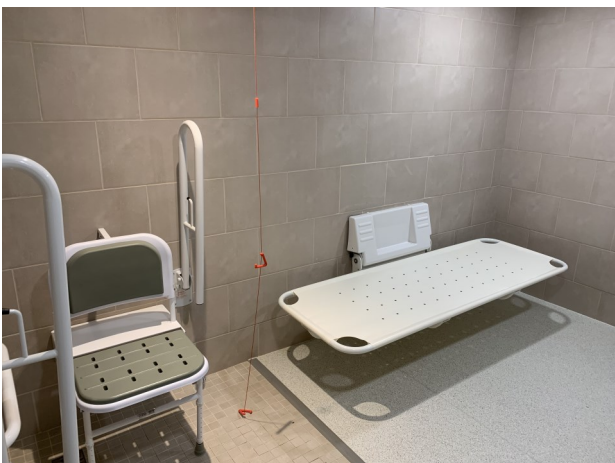
Accessible facilities in the changing rooms